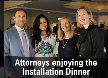
Attorneys enjoying the Installation Dinner