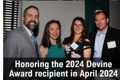
Honoring the 2024 Devine Award recipient in April 2024